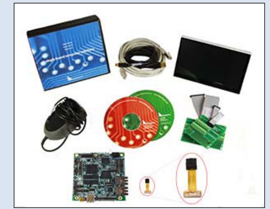
DKV1654 Contents: SBC1654, MIPI CSI camera, sample software, display, cables, and breakout assemblies